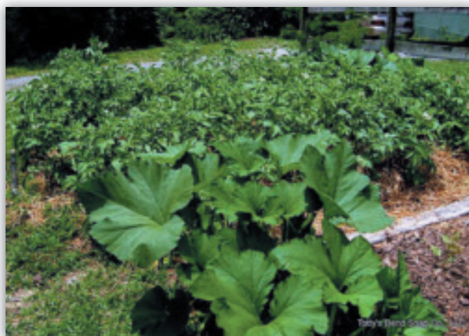
GARDEN FILLS OUT — The Totty's Bend Farm garden continued to thrive throughout the growing season, for a high yield of potatoes, carrots, squash, tomatoes and more.