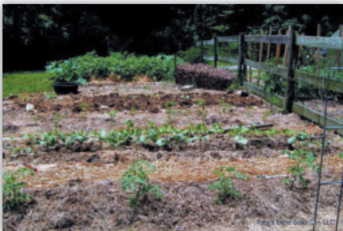
EARLY IN THE SEASON — This photo shows the Totty's Bend Farm in early April 2010.