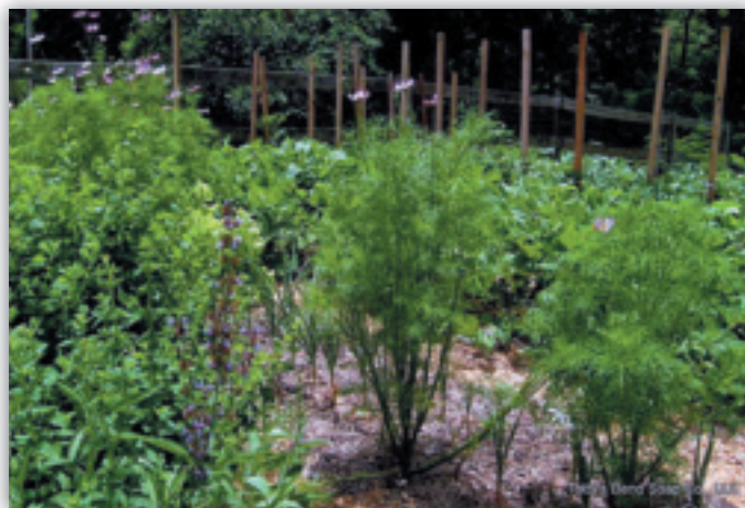
GROWING LUSH — The AGGRAND-fertilized garden contains a mixture of vegetables, herbs and flowers.