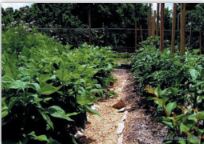
AFTER THE FLOOD — Even during a year that was unusually wet, the potato patch continued to thrive.